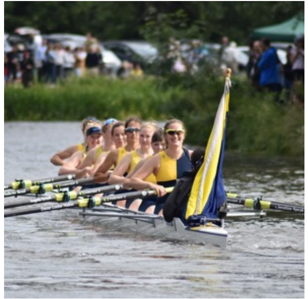
Mays Headship Crew 2019