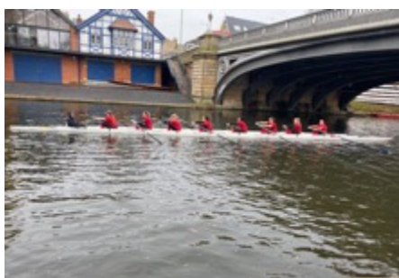
NW1 at Emma Sprints