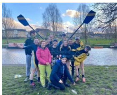
W1 with Greenery