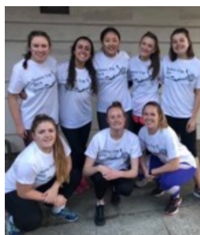
NW1 at Qergs

Two novice crews entered the Qergs Competition, erging against other colleges in an 8 x 500m relay. NW1 reached the finals and finished in 3 rd place! Meanwhile, some of the senior rowers joined forces with Hughes Hall's men to enter the mixed senior division. Dubbed 'Hewnham Hall', the team won the competition!