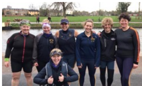
Gryphens' Morning Crew