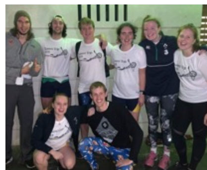
'Hewnham Hall' at Qergs