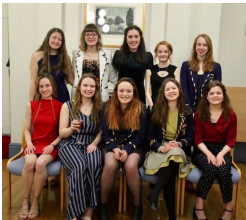
NCBC Committee at Lents Boat Club Dinner 2020