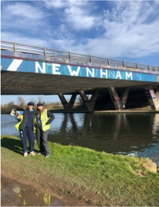
Marshalls at the Start Line

Unfortunately most racing this term was called off due to bad weather. Luckily, Newnham's race was timed perfectly to avoid Storm Ciara. Known for being the 'Friendliest race on the Cam', Newnham's Short Course Competition was rebranded this year as the Newnham Head. With a record 113 crews racing, all of NCBC's rowers and coxes helped out with the marshalling to ensure the event, led by our fantastic Regatta Sec, ran smoothly. One racer remarked: