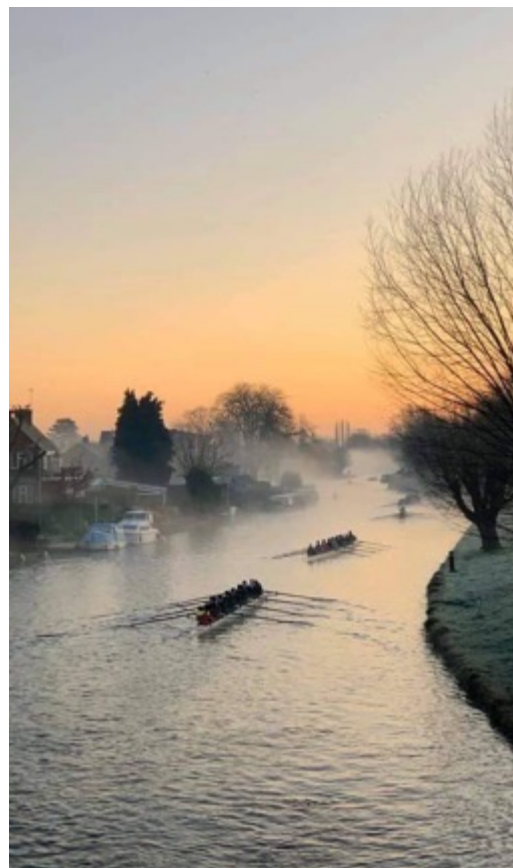
River Cam – February 2020

Whilst NCBC were devastated not to be able to defend headship at May Bumps, we are thankful that we have still been able to connect with friends virtually, with Zoom circuits, weekly games nights and various erging, walking and running challenges. In this newsletter, we share with you yet another wonderful year at NCBC. Following on from the triumphs of Michaelmas and Lent term, the 'new-normal' has provided lots of opportunities to create more fantastic memories.