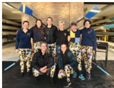
Gryphens' Afternoon Crew