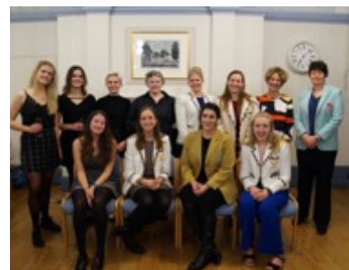
Gryphens at BCD

We were very pleased to welcome back lots of Gryphens to race against other alumni at Fairbairns. We had two fabulous VIII+ crews, who both impressed us with their fantastic strength and technique over the entire 4.3k course! Out of eleven invitational women's crews, they placed in fourth and fifth, with times of 17:53 (in the afternoon) and 18:31 (in the morning). Thank you so much to everyone who raced! We hope it was an enjoyable day for all – and that many of you will be keen to race in the 2020 competition!