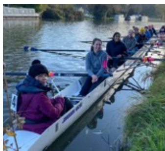
NW2 at Clare Novice's