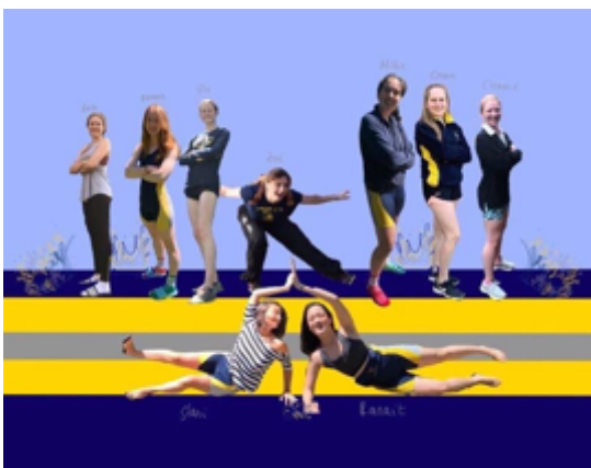
W1 for Virtual Bumps