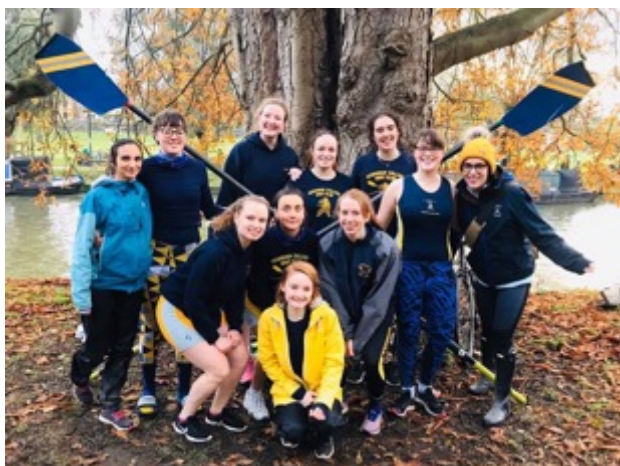
W1 at Winter Head