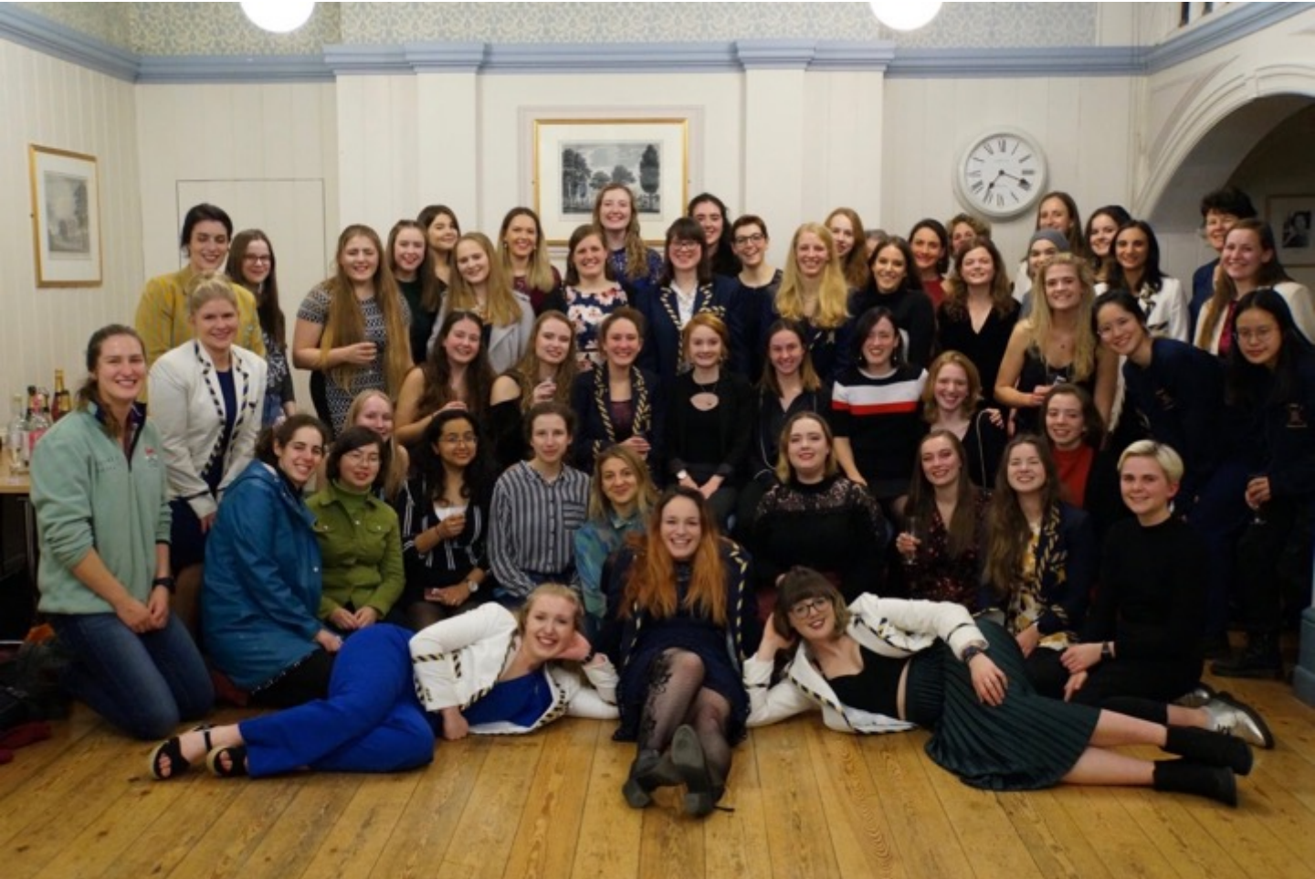
NCBC at Michaelmas Boat Club Dinner 2019