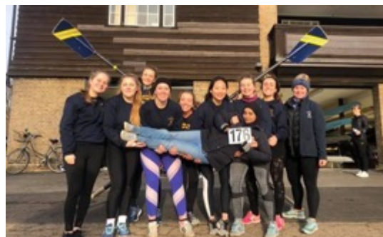
NW1 at Fairbairns

Novice crews faced a 2.7k course from Jesus College Boat House to the railings on the reach. Both crews coped with the distance well. NW1 finished in seventh place, with a time of 12:04. Meanwhile, NW2 came fifth in their division, completing the course in 13:10. This marked the end of a successful term of novice rowing for all 56 novices. Many were keen to return in Lent Term for the excitement of senior rowing.